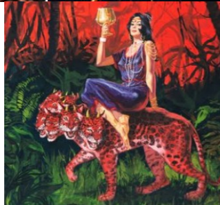
IMAGE TO THE BEAST